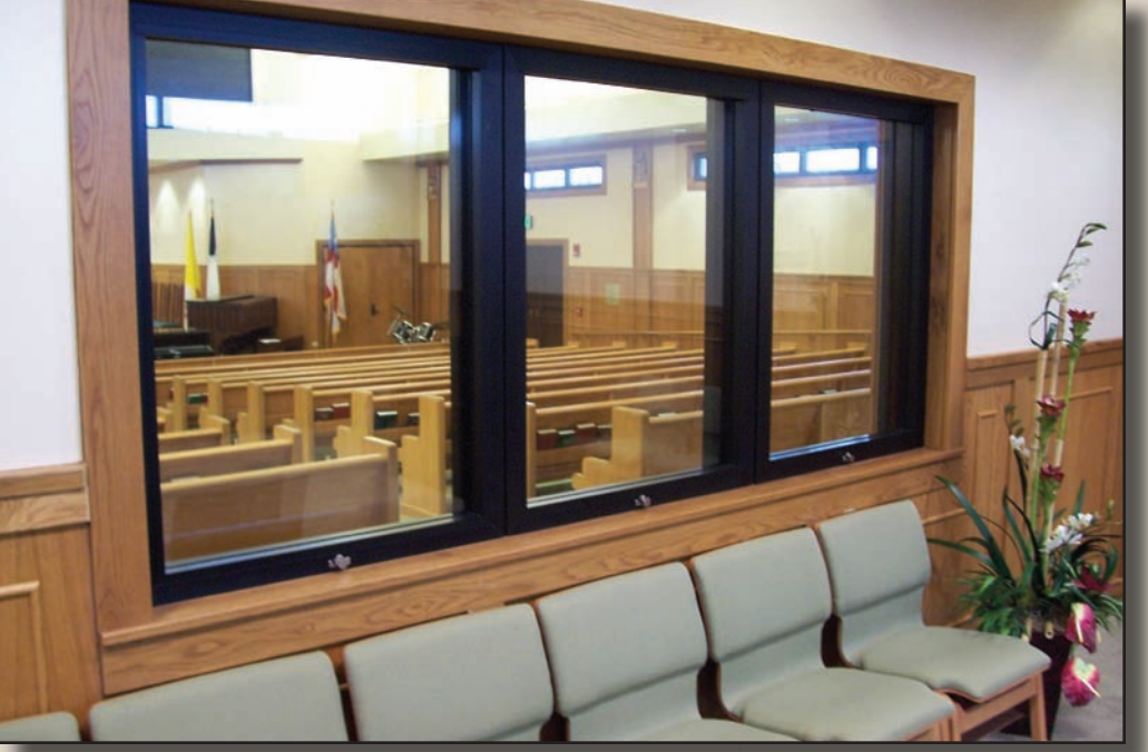
7250 Series Acoustic Sound Windows